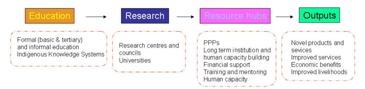
Figure 1: Schematic representation of the key components involved in the National System of Innovation.

does not formally recognize social innovation in practice and does not include a bottomup participatory approach that requires communities to participate actively.